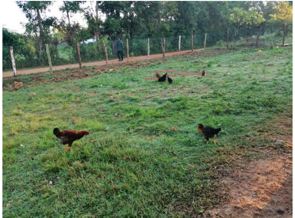
2 months old chickens

This practice gives some general information on small-scale chicken production and explains the benefits of producing at a smaller scale with minimum risks but improved output.